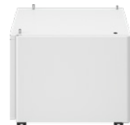
PLAIN PEDESTAL TYPE J-2 • Raises the device, no additional media supply

This flat configuration is for illustration purpose only. For a complete list of options and the exact compatibility, please refer to the Online Product Configurator or consult your sales representative.